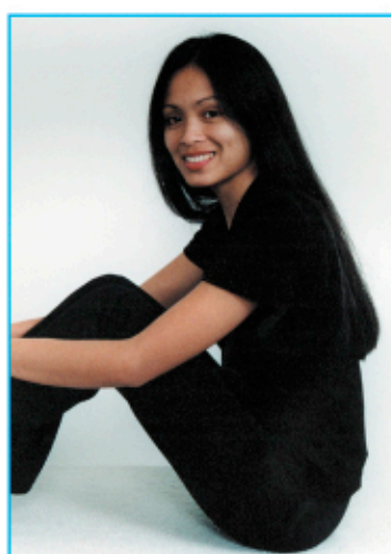
BlueGirls Understudy Lelit

say that Liquid Blue is, "One the best local acts who have been in here in a long time."