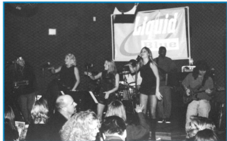
Rockin' the house

How has Liquid Blue developed such a large following so quickly?